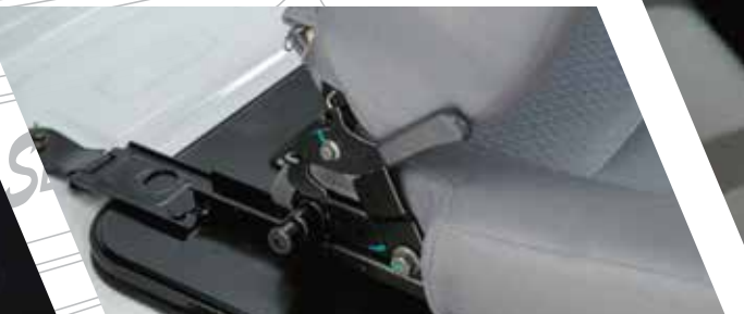
Seats Forward Backward Sliding with Convenient Adjustment