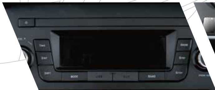
Digital MP3/FM Control Board