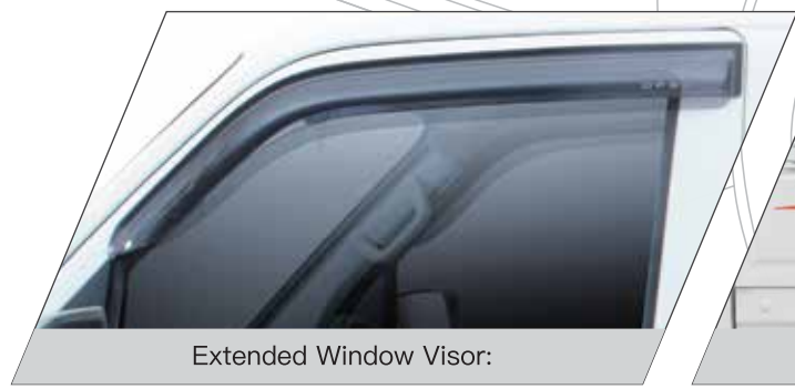
Extended Window Visor: