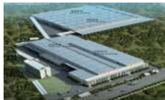
Bird's eye view of Sokonindo Factory