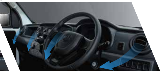
Four Air Outlets / Super Cooling A/C