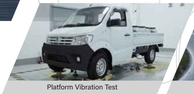
Platform Vibration Test