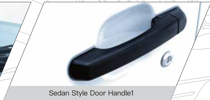
Sedan Style Door Handle1