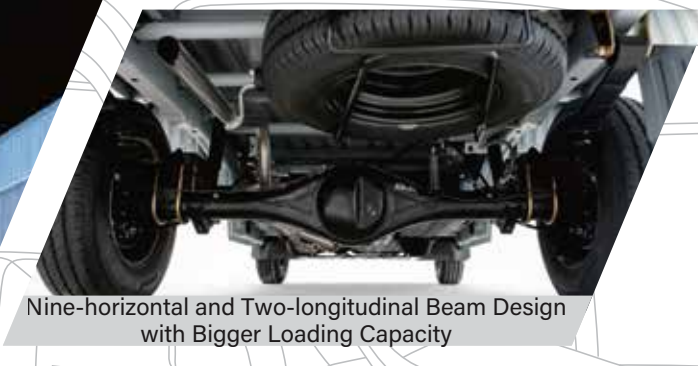
Nine-horizontal and Two-longitudinal Beam Design with Bigger Loading Capacity