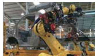
Robotic Welding System