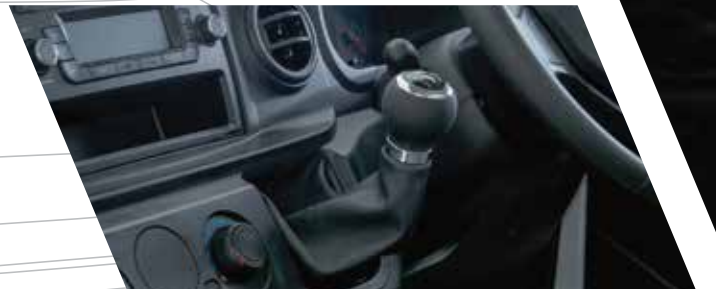
Central Gear Lever