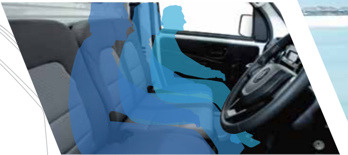
Spacious Room for Three Passengers