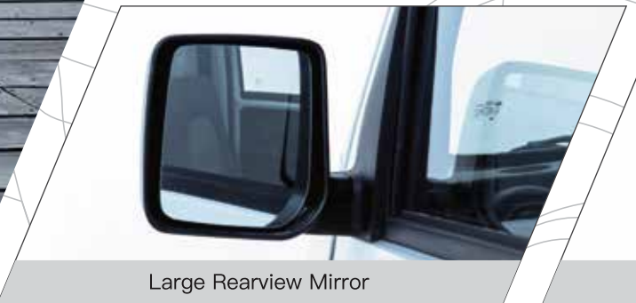
Large Rearview Mirror