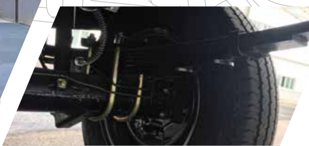
Six Upper Leaf Spring with Higher Ground Clearance for Better Access Under Various Road Conditions