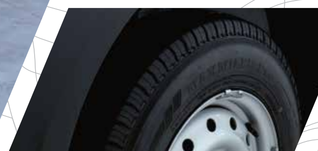
1.5L Gasoline Engine with 185mm Tire Width 1.3T Diesel Engine with 195mm Tire Width