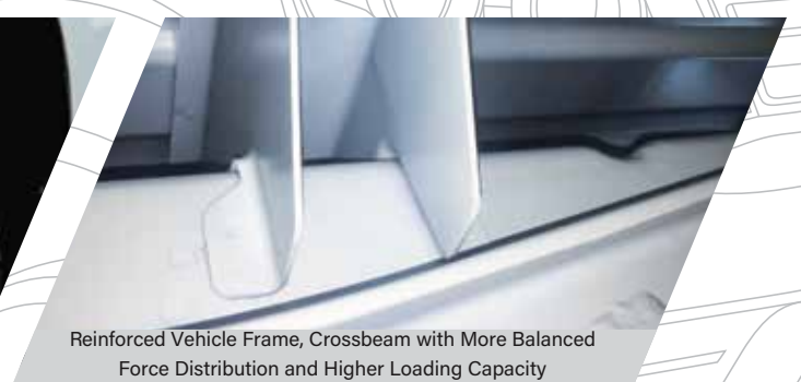
Reinforced Vehicle Frame, Crossbeam with More Balanced Force Distribution and Higher Loading Capacity