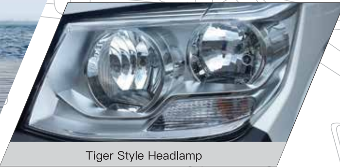
Tiger Style Headlamp