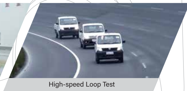
High-speed Loop Test