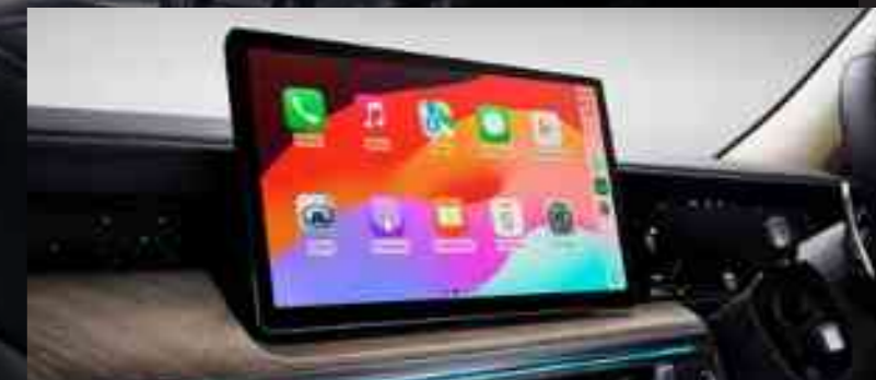
14.6" Display Screen with Wireless Apple CarPlay® and Android Auto™