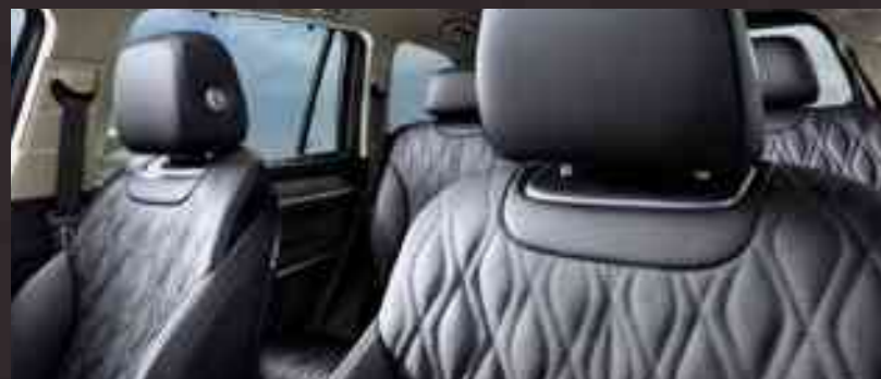
Premium Nappa Leather Seats

Beyond its striking design, the GWM TANK 500 is built for ease and relaxation. Thoughtfully engineered features enhance comfort at every turn, from adaptable seating to intuitive technology that simplifies every journey.