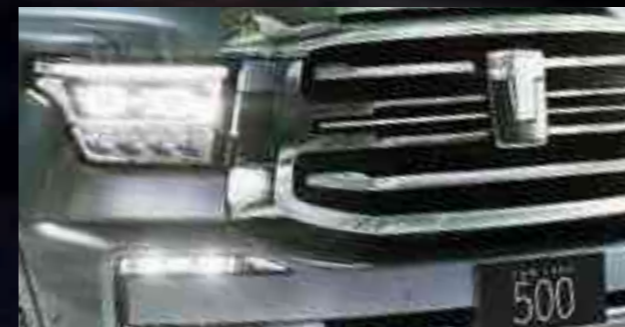
Intelligent LED Headlamps

A STATEMENT OF STRENGTH. A SANCTUARY FOR LUXURY.