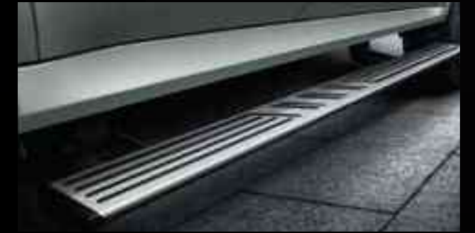
Electric Side Step