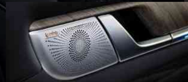
12-speaker Premium Infinity® Sound System