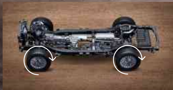
Front & Rear Electrical Differential Locks