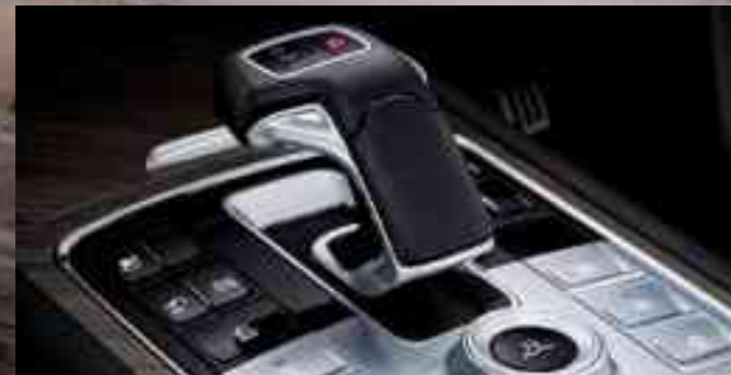
Intelligent All-terrain System