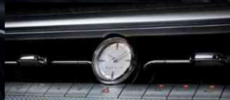
Elegant Classic Clock