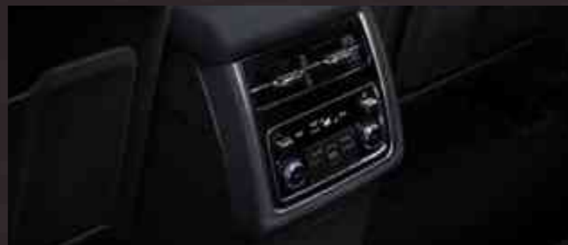
2nd-row Ventilation Control Panel