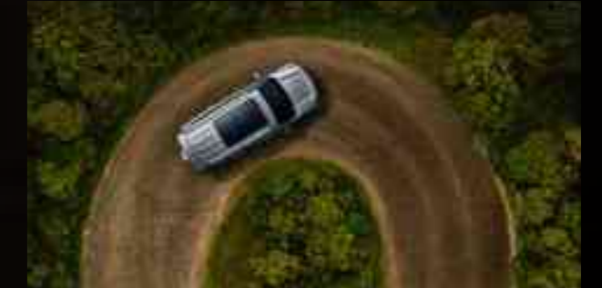
Tank Turn Assist