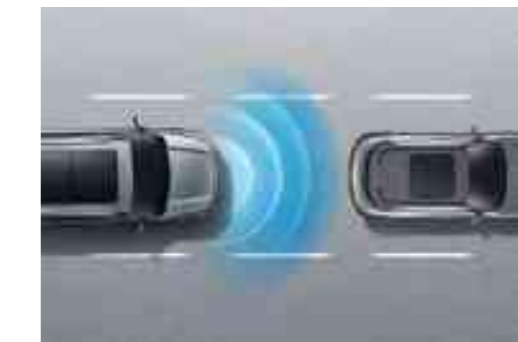
AEBI Auto Emergency Braking + Intersection MEB Manoeuvre Emergency Braking FCW Front Collision Warning