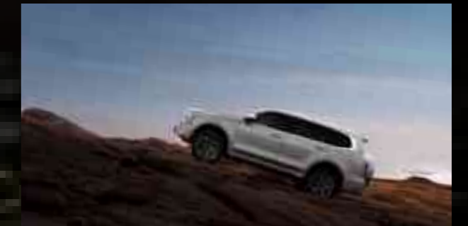
75% Maximum Climbing Degree