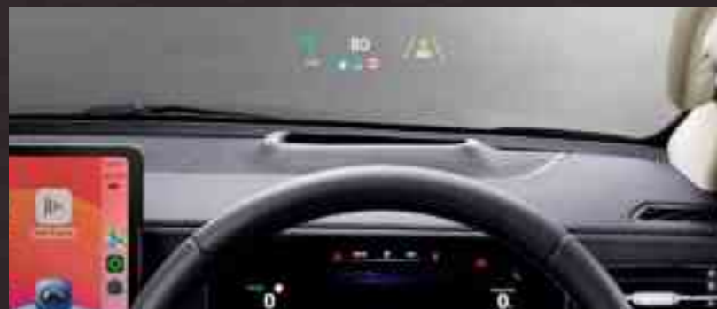
Heads-up Display (HUD)