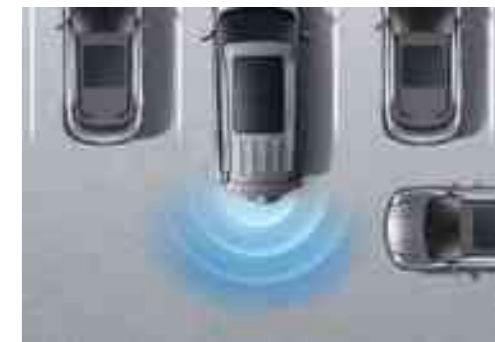
RCTA Rear Cross Traffic Alert RCTB Rear Cross Traffic Braking