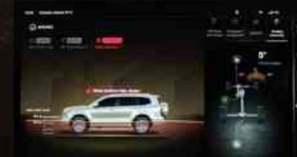
Wading Depth Detection

Wherever the road takes you, the GWM TANK 500 is designed to handle it with ease. No matter how unpredictable the path, you're always in control whether it's steep descents or deep waters thanks to its intelligent systems and optimised angles that make even the toughest terrains feel effortless.