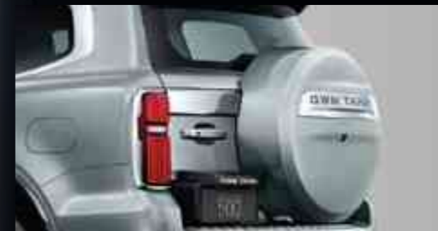
Tailgate with Electric Suction