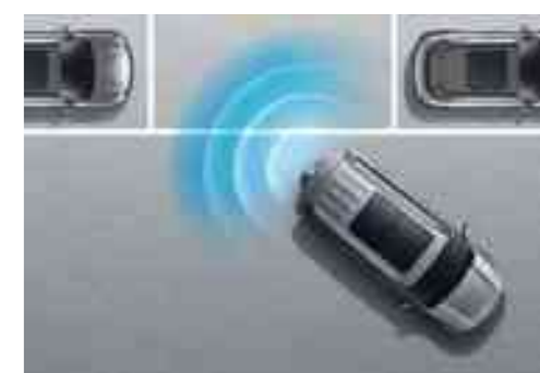
IIP 3 Types of Integration Intelligent Parking 360° Surrounding Camera