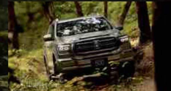
Off-road Cruise Control