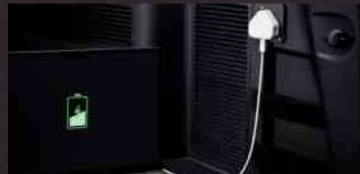
220V Power Supply Slot (400W)