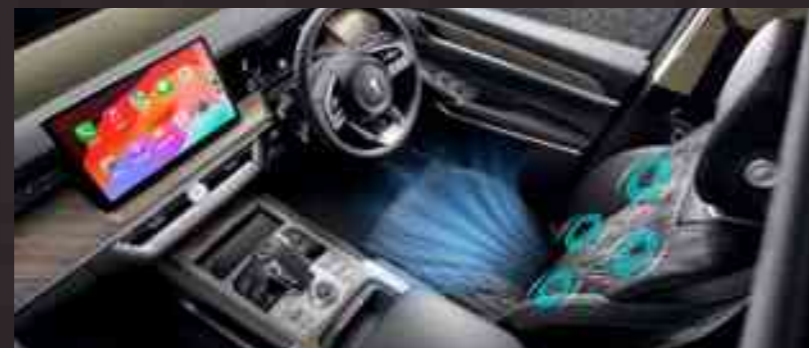
1st-row Massage Seats and Ventilation Function