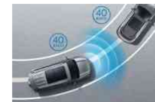
ACC Adaptive Cruise Control ICC Intelligent Cornering TJA Traffic Jam Assist