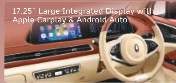
17.25" Large Integrated Display with Apple Carplay & Android Auto