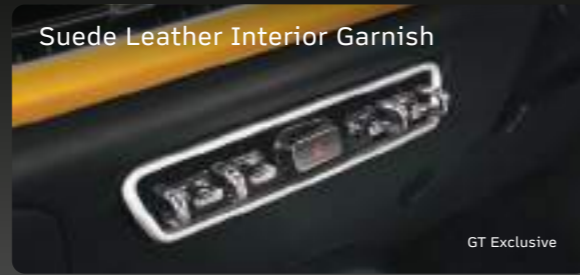
Suede Leather Interior Garnish