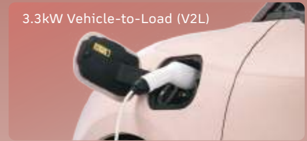
3.3kW Vehicle-to-Load (V2L)