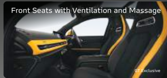
Front Seats with Ventilation and Massage