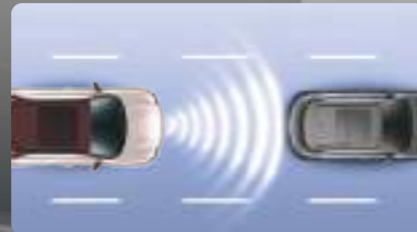
Manoeuvre Emergency Braking