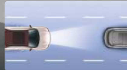
Adaptive Cruise Control with Intelligent Cornering