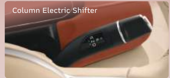
Column Electric Shifter