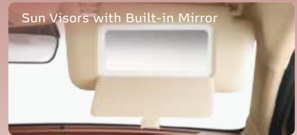
Sun Visors with Built-in Mirror