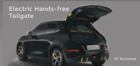
Electric Hands-free Tailgate