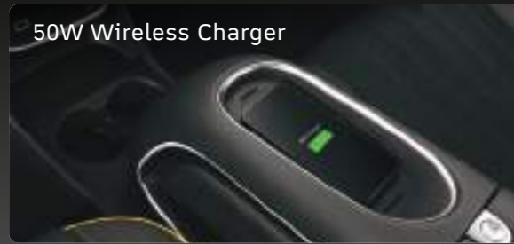
50W Wireless Charger