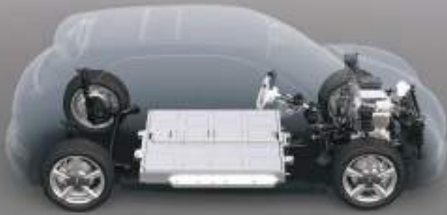
One of the World's Safest Batteries with Full-dimensional Ecological Heat Management System