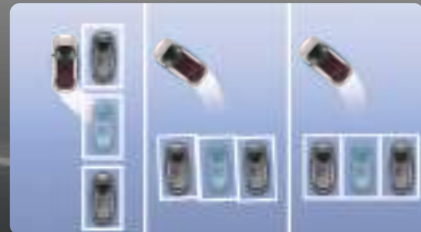
3 Types Integrated Intelligent Parking