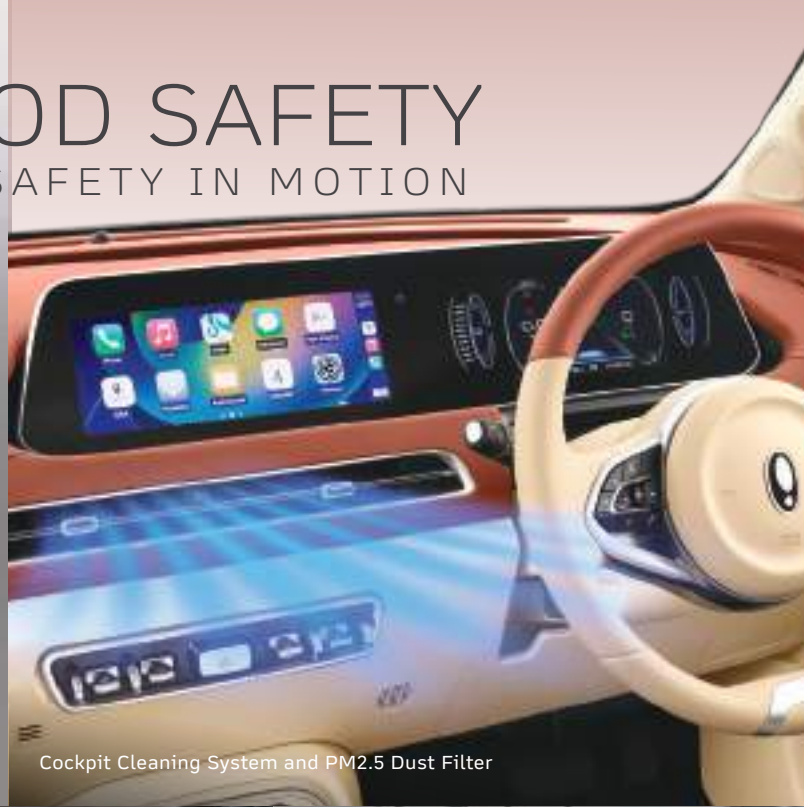
Cockpit Cleaning System and PM2.5 Dust Filter