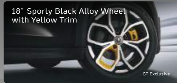
18" Sporty Black Alloy Wheel with Yellow Trim