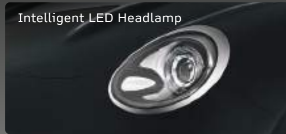
Intelligent LED Headlamp