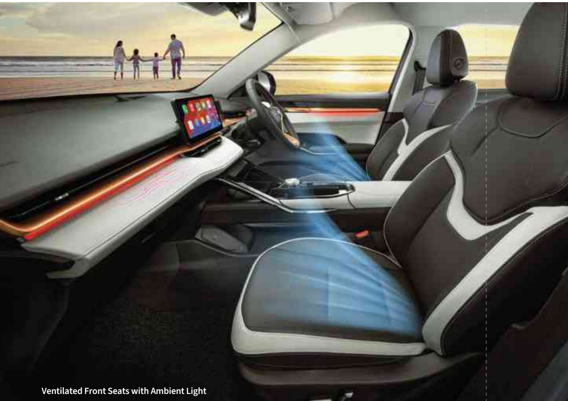
Ventilated Front Seats with Ambient Light