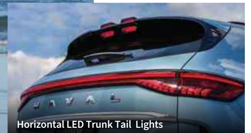
Horizontal LED Trunk Tail Lights