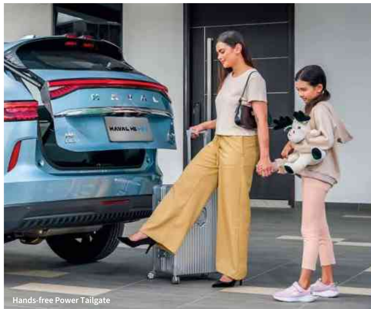
Hands-free Power Tailgate