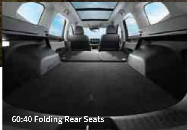
60:40 Folding Rear Seats