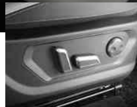
6-Way Power Adjustable + 2-Way Lumbar Support