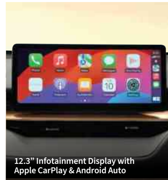
12.3" Infotainment Display with Apple CarPlay & Android Auto