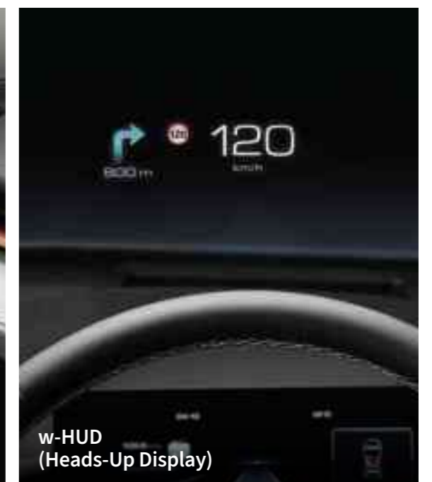
w-HUD (Heads-Up Display)