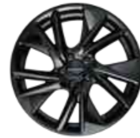
19-Inch Alloy Wheels