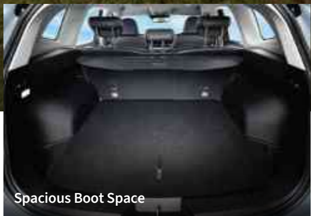
Spacious Boot Space