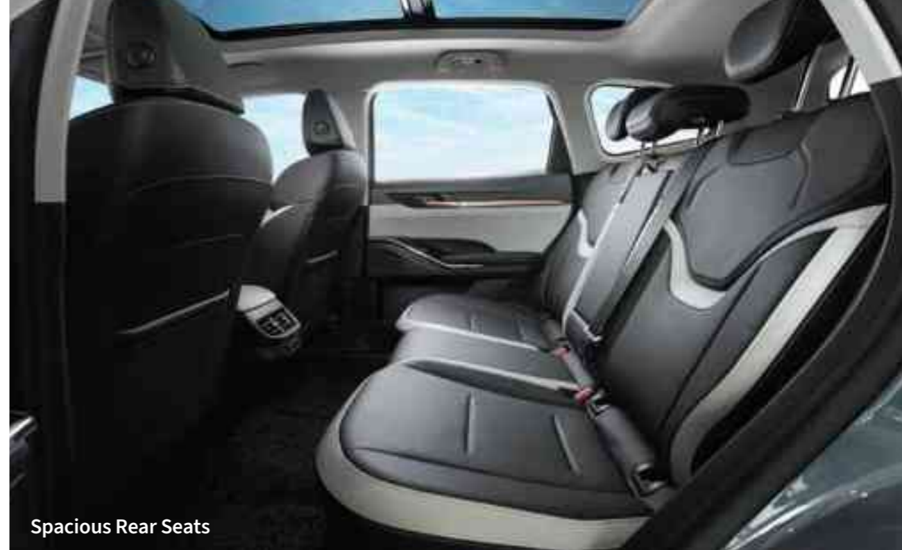
Spacious Rear Seats