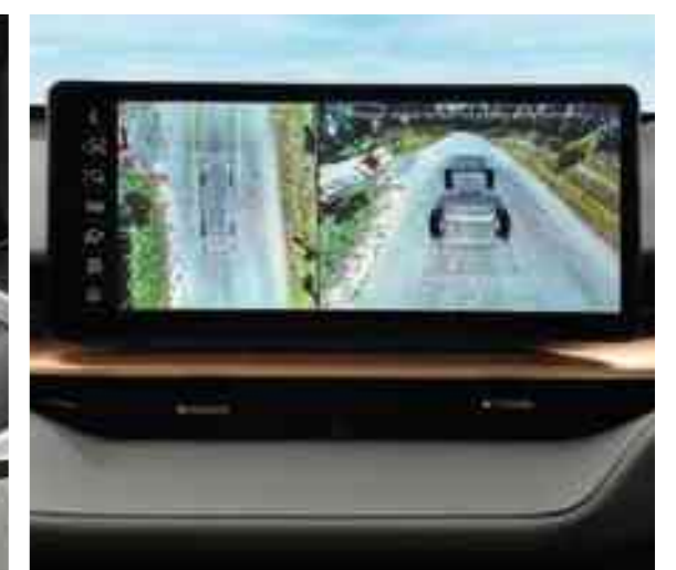
360 Around View Camera and Transparent Chassis Function