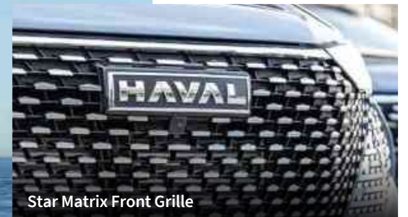
Star Matrix Front Grille