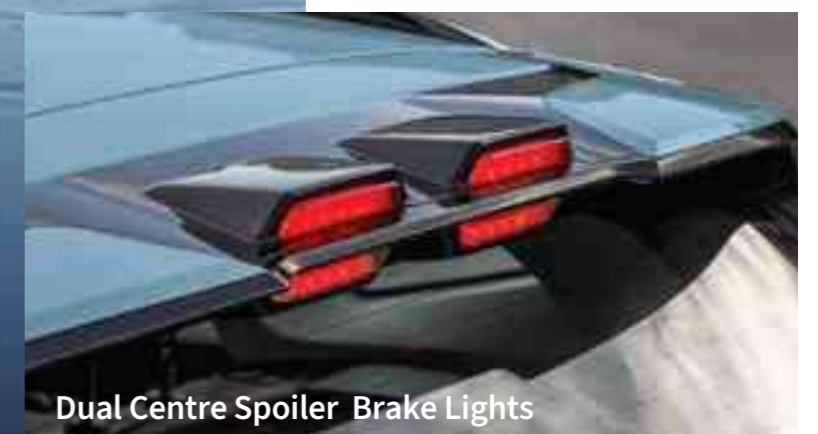
Dual Centre Spoiler Brake Lights