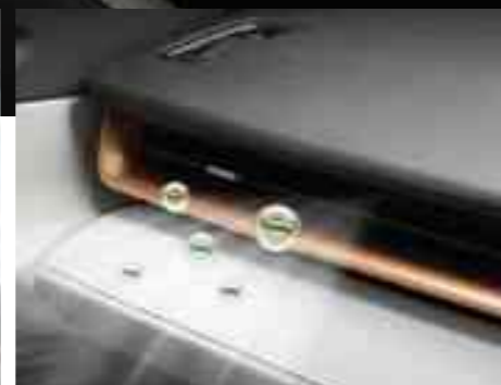
Negative Ion Air-Cleaner