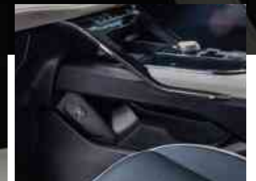
Rotary Shift + Dual Level Centre Console with Extra Storage