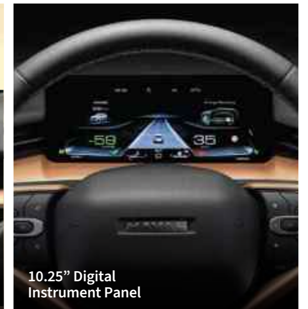
10.25" Digital Instrument Panel