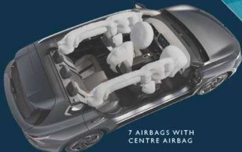
7 AIRBAGS WITH CENTRE AIRBAG

The MGS5 EV is equipped with ADAS Level 2.5 and a 5-star NCAP rating, delivering advanced protection and confidence alongside features such as Autonomous Emergency Braking (AEB), Lane Keep Assist (LKA), Rear Cross Traffic Alert (RCTA), and Drowsiness Monitor System (DMS). Seven airbags, including a centre airbag, along with a reinforced chassis and advanced braking system, further enhance safety and control.