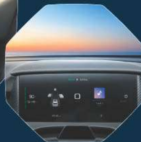
10.25" INSTRUMENT CLUSTER

The MG5 EV keeps you connected with a 12.8" Central Display and 10.25" Instrument Cluster, supported by MG iSMART to keep you effortlessly connected to your car. Voice control enables hands-free interaction, while Vehicle-to-Load (V2L) technology delivers up to 6kW of power, turning your car into a power source on the go.