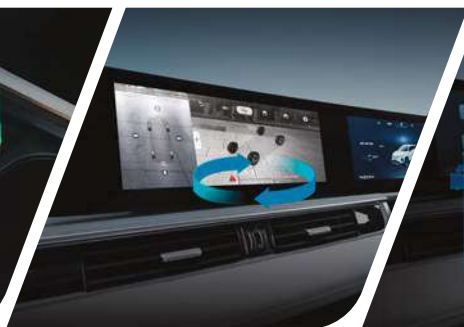
540° HD Panoramic Camera