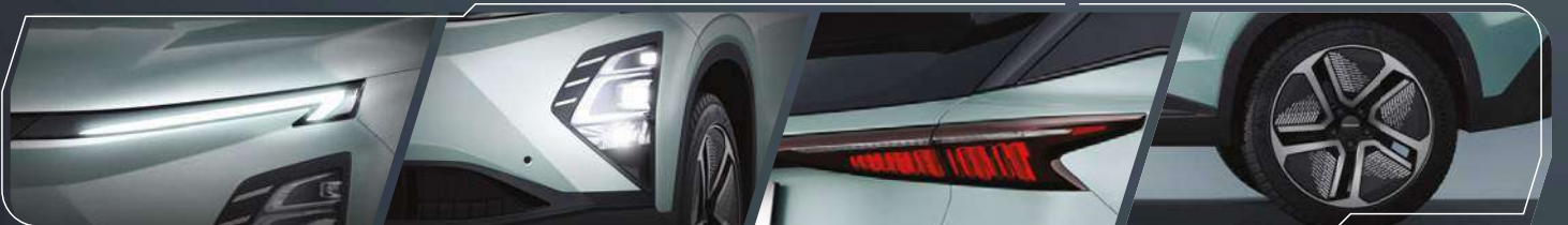
LED Daytime Running Lamp (DRL)