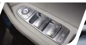
Power All Window