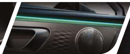
Multi-Color 1st Row & 2nd Row Ambient Light