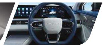
Multi-Function Steering Wheel