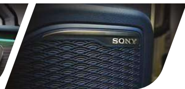
Sony B Speakers