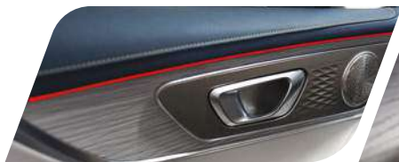
Multi-Color Interior with Soft Touch Material