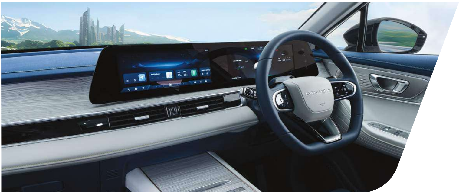
Futuristic Cabin with 24.6 inch Super Large Curved Screen