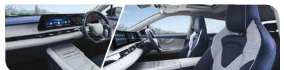
Blue & Beige