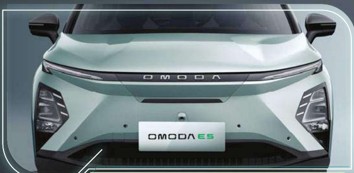
X Future Tech Front