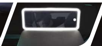
Futuristic Sunvisor with New Tech-Light System