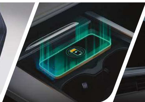
50w Smartphone Fast Wireless Charger with Cooling System