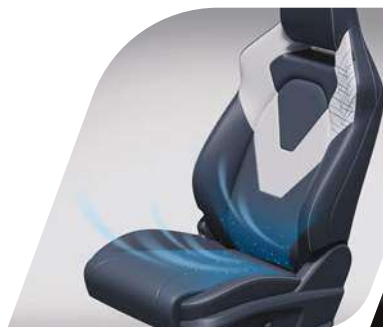
Driver & Passenger Ventilated Seat