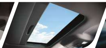
Intelligent Power Sunroof