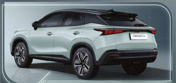
Light & Shadow Cutting Streamlined Body