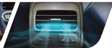
Second Row Multi A/C