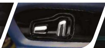
Driver and Passenger Electric Seat Adjuster