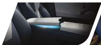
Front Armrest with Cooling System