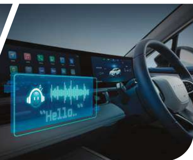
Intelligent Voice Assistant