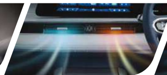
Two Zone A/C