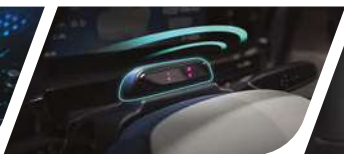
Driver Monitoring System (DMS)