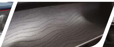
Special Wood Panel Dashboard