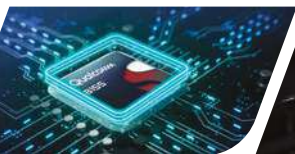
BISS Qualcomm Chip