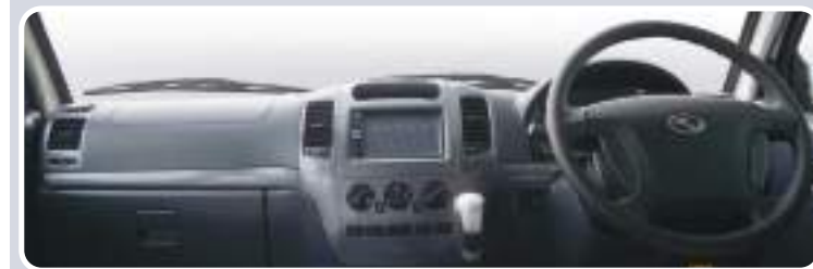
Modern Dashboard with 4-Spoke Tilt Adjustable Power Steering Wheel