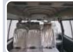
Spacious Passenger Seat