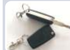
Switchblade Key with Remote Control