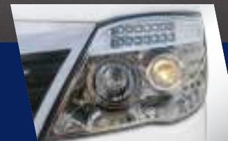
Projection Head lamp & LED Light