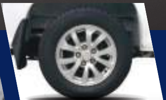
Sport Rim (Optional Accessories)