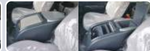
Middle Console Box