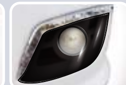
Modern Design Foglamp