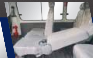
Fully Reclinable Seat Bed with Side Shift*