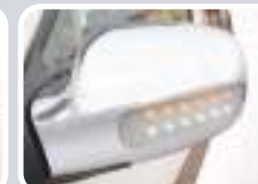
Side Mirror with Signal Lamp & Daylight